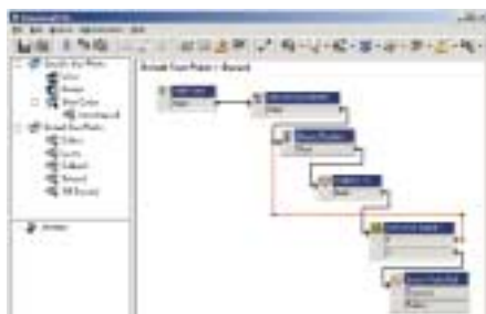
Example of advanced queue announcements that can be provided by VoiceMail Pro

That’s why Avaya IP Office provides the VoiceMail Pro option, with key features that help you further refine customer relationship management in your business: